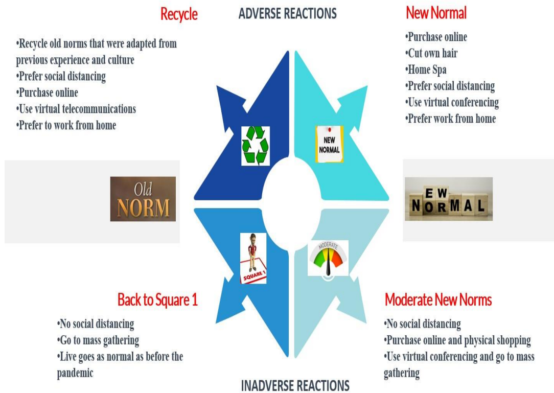
Figure 2: Post Pandemic Consumer Behavior Conceptual Framework

As such, we proposed a post pandemic conceptual framework in explaining consumer behavior post pandemic. The framework consists of four quadrants of consumer behavior, which is back to square 1 (or old normal), new normal, moderate new normal, and recycle. The proposed conceptual framework is presented in Figure 2.