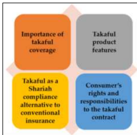
Figure 2: Categories that exist in the spectrum of consumer awareness of takaful

All in all, it is important that consumer awareness of takaful covers all four categories in the spectrum to ensure the efforts taken to promote awareness of takaful are delivered in a comprehensive and effective manner. The summary of the categories of consumer awareness in takaful is presented in the figure below: