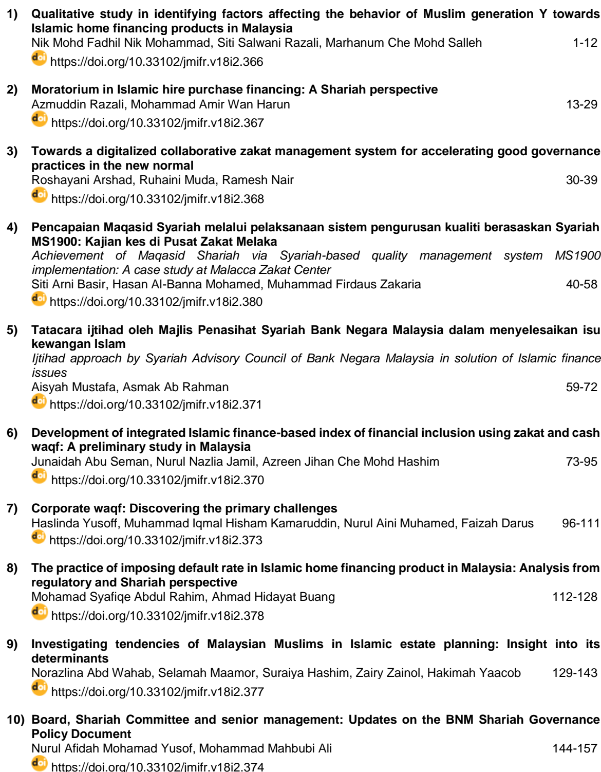
TABLE OF CONTENTS REGULAR ISSUE: VOL. 18 NO. 2 DEC 2021